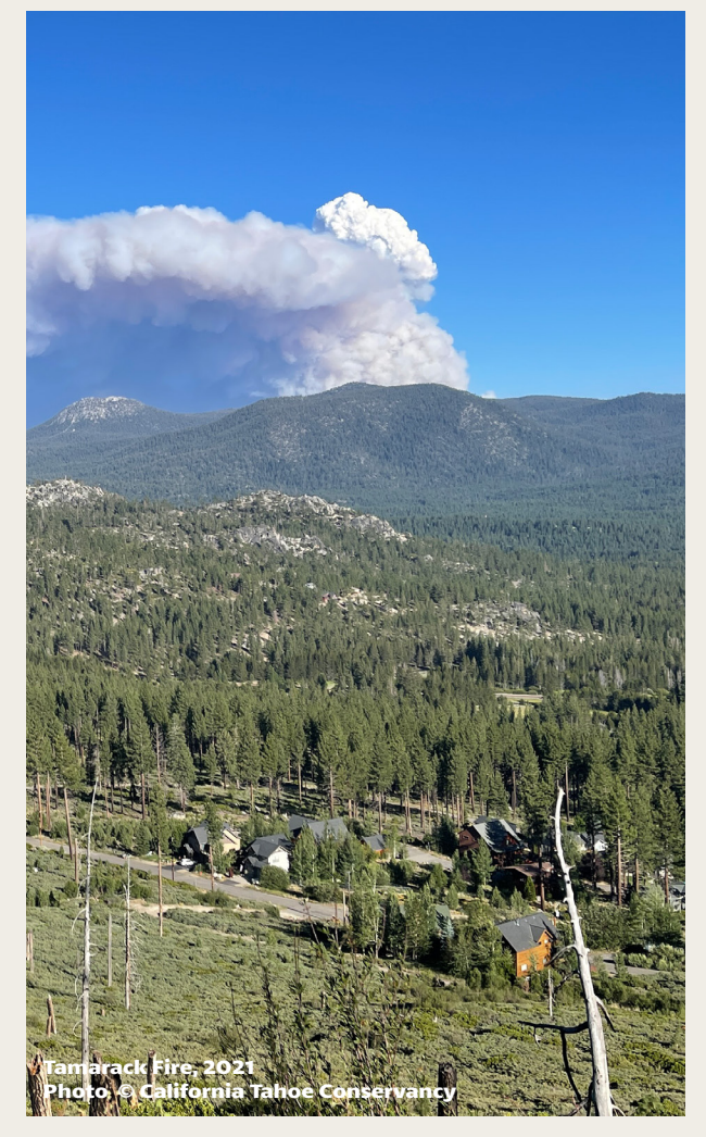
IF YOU SEE SMOKE OR FIRE DIAL 9-1-1

A GUIDE FOR LAKE TAHOE LONG-TERM RENTERS